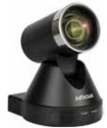
RealCam PTZ Camera

Thunder Speakerphone (INA-TH150): VoiceAware anti-echo & noise-reducing technology for any size meeting room