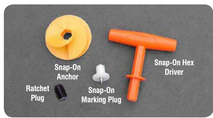
NOTE: Snap-On Anchors should only be used with 2" ProPanels. DO NOT USE with 1" ProPanels.