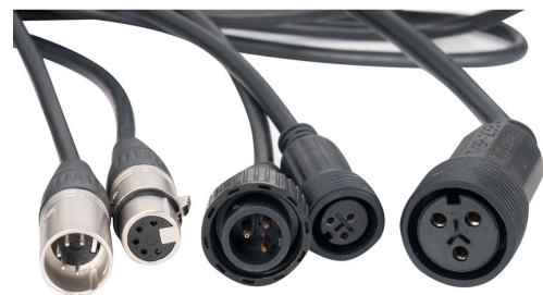
Included Cables 3pin IP to 5pin DMX In 3pin IP to 5pin DMX Out 3pin IP to 3pin Edison Power