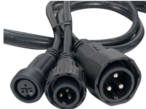
Connections 3pin IP Data In 3pin IP Data Out 3pin IP Power In