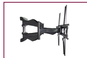
Expands flat panel displays up to 18 inches from the wall