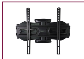
Flat panel mount collapses to 2.2 in. from the wall