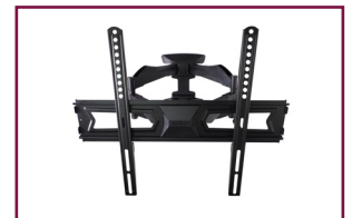
Designed to offer 12 degrees of downward tilt for today's slim line flat panels