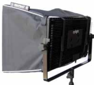
IS3c with DoP Choice Softbox