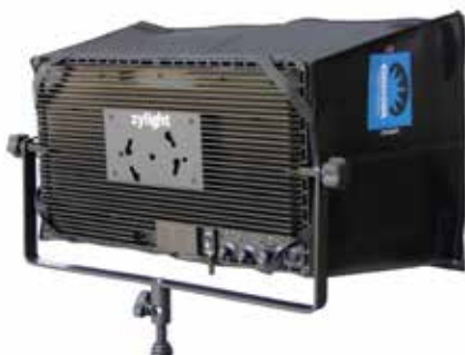
IS3c with Chimera Softbox

The c version of this unit denotes the addition of softbox accessory from Chimera or DoP Choice .