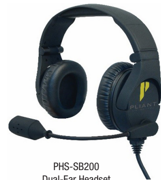
PHS-SB200 Dual-Ear Headset

Pliant Technologies, LLC CrewCom® 205 Technology Parkway Auburn, Alabama 36830 USA www.plianttechnologies.com Phone +1.334.321.1160 Toll-Free 1.844.475.4268 or 1.844.4PLIANT Fax +1.334.321.1162