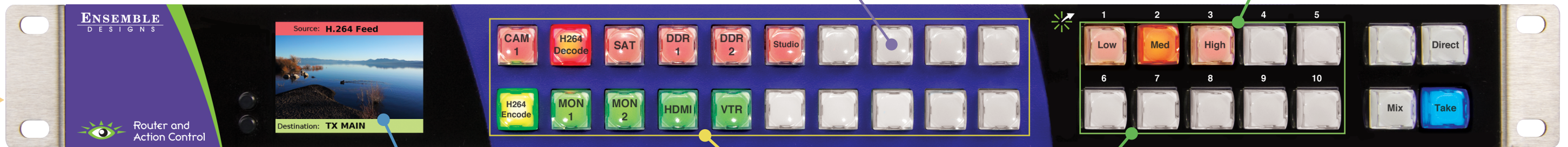
5835 Router and Action Control Panel