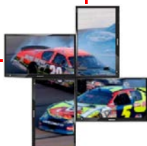
Create unique video wall arrangements

The UltraVista Plus can display the input signal in full on each output display, divide the input signal into quadrants and display each quadrant in a 2x2 display array, optionally convert the frame rates, crop the input signal, upscale specific areas, and much more. With the UltraVista Plus you can design your video wall in different variations and layouts that are sure to attract an audience.