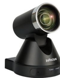
RealCam PTZ Camera

Thunder Speakerphone (INA-TH150): VoiceAware anti-echo & noise-reducing technology for any size meeting room