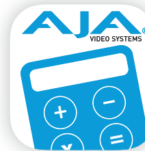
AJA DataCalc Application

Pak Media is a high-capacity solid state drive encased in a protective housing with rugged connection engineered to handle the rigors of repeated use in the field and is available in 256GB/512GB and 1TB as Pak256, Pak512 and Pak1000 respectively.