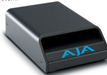
AJA Pak Dock

Ki Pro Quad lets you record edit friendly 4K/UltraHD, 2K, or HD ProRes files directly to removable AJA Pak Media. Once removed from the Ki Pro Quad, the Pak can be inserted in the AJA Pak Dock which connects directly to your computer via Thunderbolt or USB 3.0, allowing you to rapidly transfer ProRes QuickTime® files that are ready for use immediately in your nonlinear editing system.