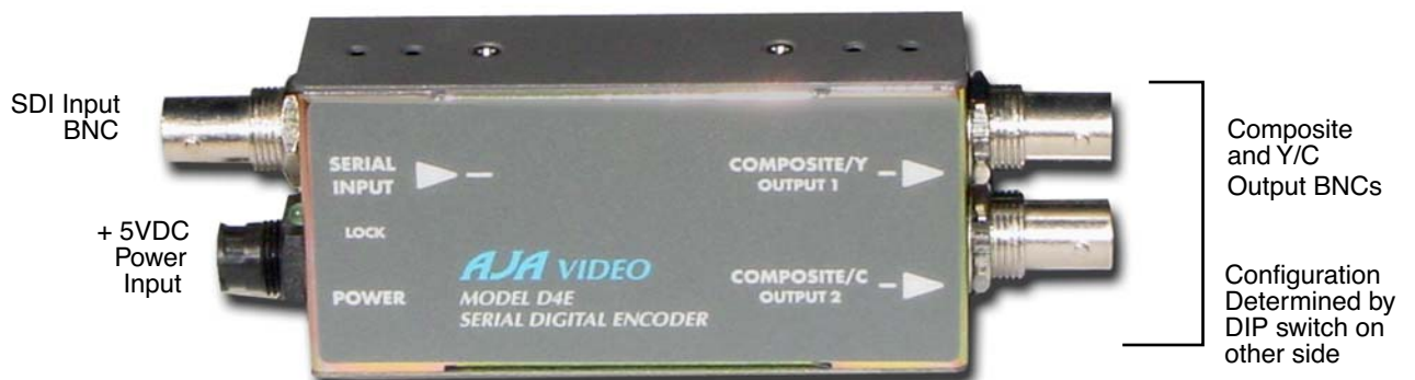
D4E, Side View