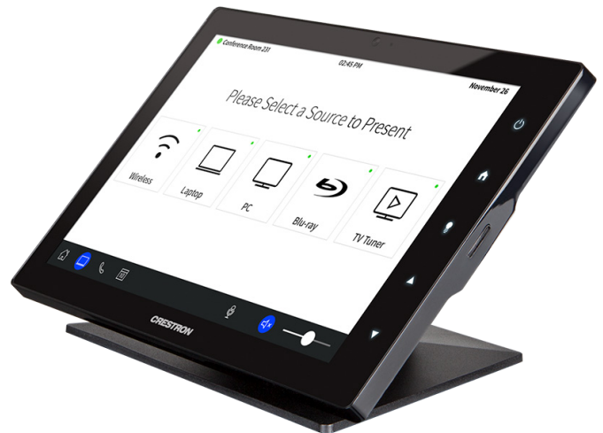
TSW-1060-B-S with TSW-1060-TTK-B-S Tabletop Kit

and other text content at a reduced brightness level