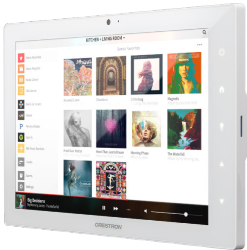
TSW-1060-W-S – Shown in White