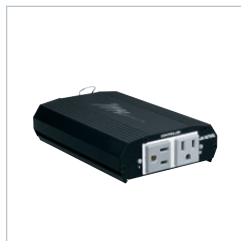
Select Series PDU with RackLink™: RLNK-215