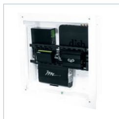
Proximity Series In-Wall Box