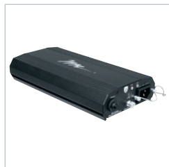
Compact surge: PD-215, PD-28-SP