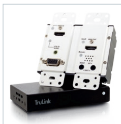
C2G® Amplifier (40880), HDBaseT, HDMI Products