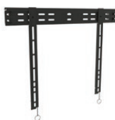
Fixed 800 VESA VDM-800-F-LP