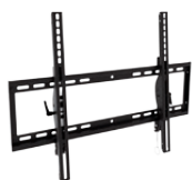
Tilt 600 VESA VDM-600-T