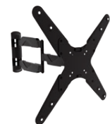
400 VESA VDM-400-M