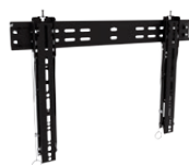
Tilt 600 VESA VDM-600-T-LP