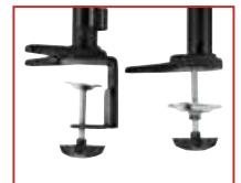
Clamp-on and grommet mount option

For wood or composite surfaces up to 3" (76mm) thick