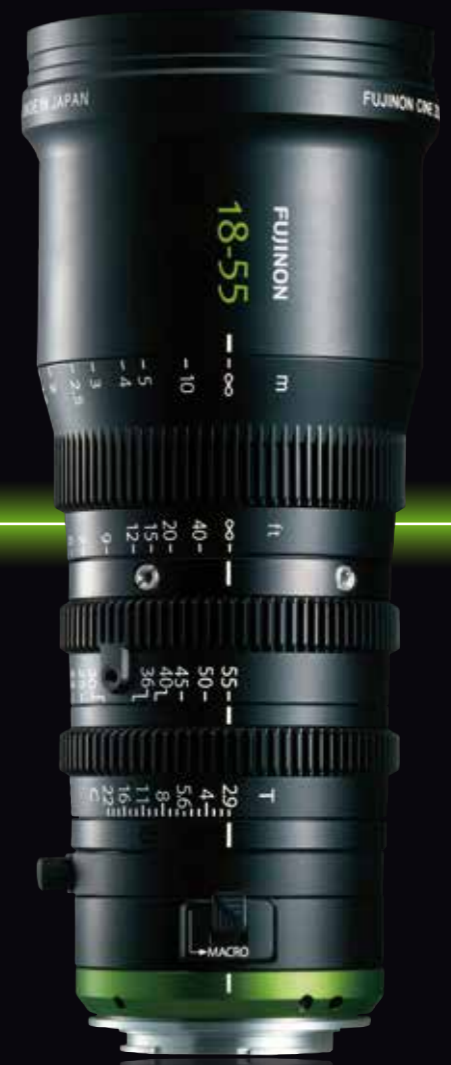
On sale summer 2017