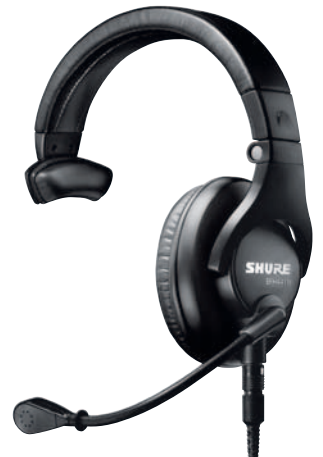
BRH441M Single-Sided Broadcast Headset