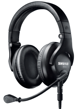
BRH440M Dual Sided Broadcast Headset