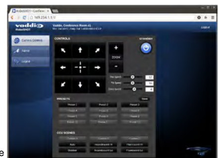
Image: Example of Built-in Camera Control Web Page

The RoboSHOT cameras were designed for the times and represent a new era in specifying and integrating professional quality cameras into A/V and conferencing system configurations. In short, it has never been easier to integrate cameras into any project than with the RoboSHOT HDMI cameras