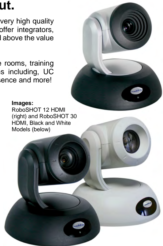
Images: RoboSHOT 12 HDMI (right) and RoboSHOT 30 HDMI, Black and White Models (below)