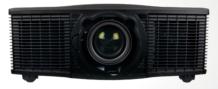
Optional color wheel for rich color content

Power zoom, focus and lens shift allows adjustments from the ground - not on a ladder