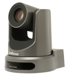
RealCam PTZ Camera

Thunder Speakerphone (INA-TH150): VoiceAware anti-echo & noise-reducing technology for any size meeting room