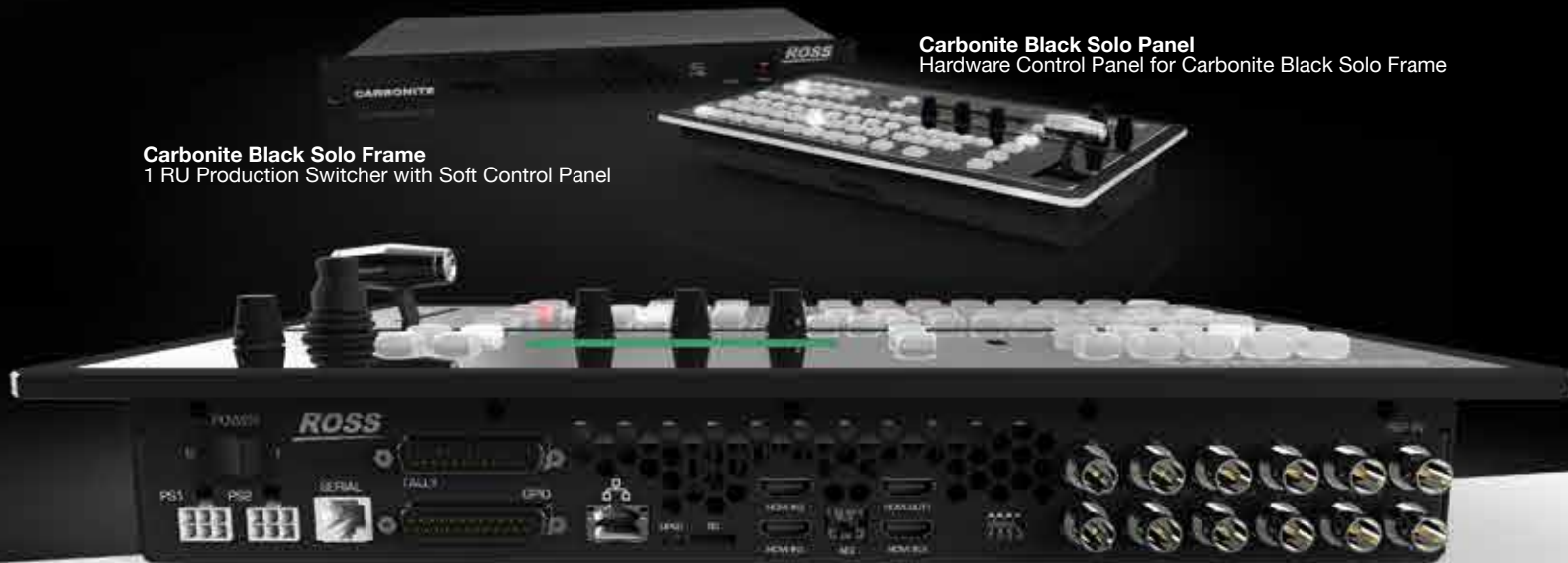
Carbonite Black Solo Panel Hardware Control Panel for Carbonite Black Solo Frame