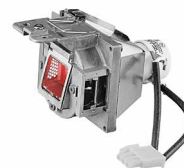
P/N: 5J.J9R05.001 / 5J.JC205.001