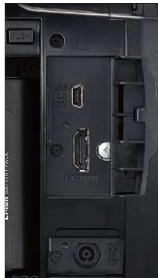
Rear Terminal (when cover is open)