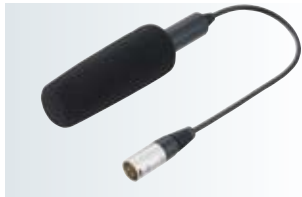
AG-MC200G XLR Microphone