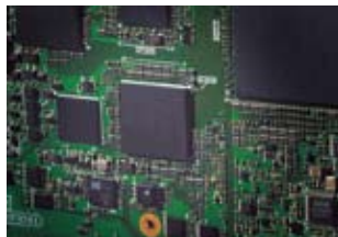
AVC-ULTRA Codec LSI

A security function featured on the microP2 card. The content recorded on the card is locked with a password to protect against unauthorized access. This prevents data from being stolen and enables secure media control.