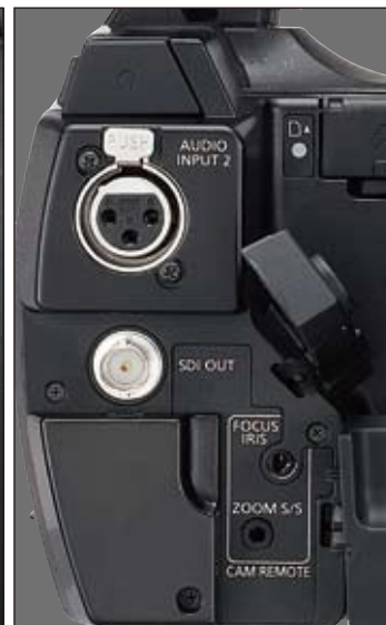
Side Terminal (when cover is open)