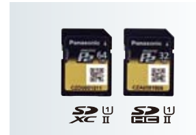
AJ-P2M064AG (64 GB) AJ-P2M032AG (32 GB) microP2 Card