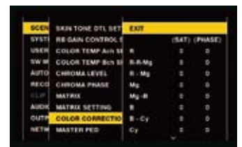
Image adjustment menu

The AJ-PX230's camera signal processing LSI enables hue-adjustable 12-axis color compensation for each color gamut, independent 3-axis skin-tone color compensation, and also has a detailed image adjustment function. The image adjustment menu brings you intuitive image control.