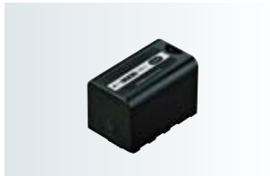
VW-VBD58 Battery Pack (5,800 mAh)