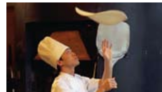
Overcranking (higher-speed shooting)