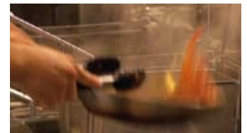
Undercranking (lower-speed shooting)