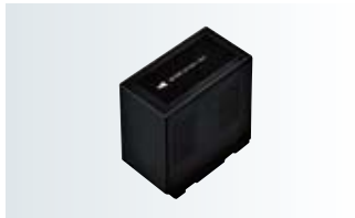
CGA-D54/CGA-D54s Battery Pack (5,400 mAh)