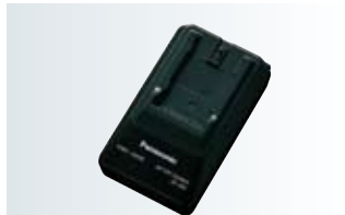
AG-B23 Battery Charger