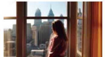
Dynamic range 600%