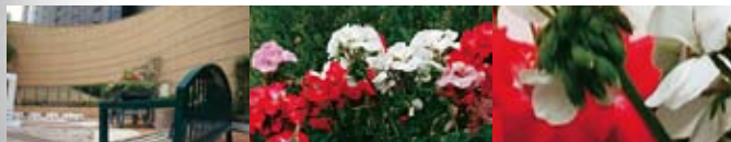
Wide 28 mm