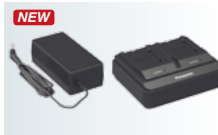
AG-BRD50 Battery Charger with Quick-Charge Capability *Quick-charge is not supported with the VW-VBD58, CGA-D54/D54s battery packs.