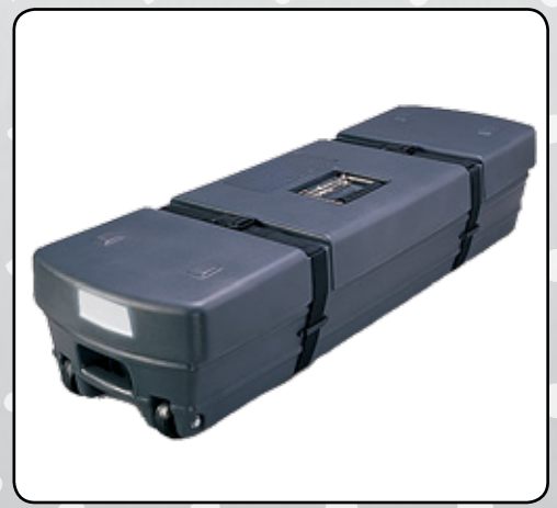
Award winning carrying case design

For more information on this product visit: www.draperinc.com/go/Cinefold.htm