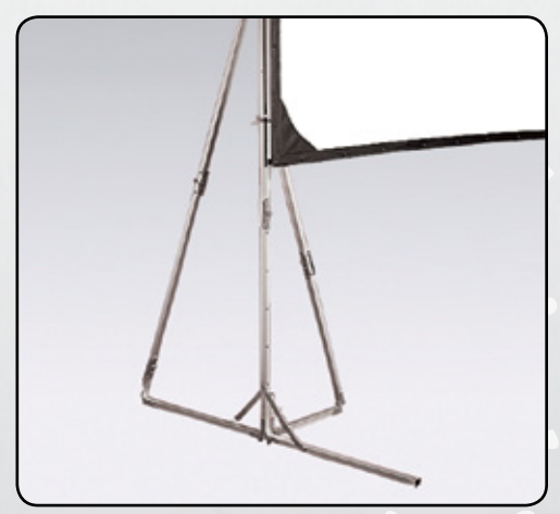
Cinefold Heavy Duty Leg