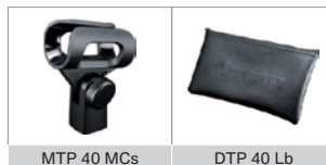
MTP 40 MCs