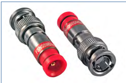
FSNS59BNCU ProSNS™ Universal BNC Connector