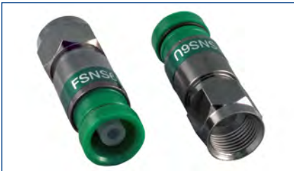
FSNS6U ProSNS™ Universal F Connector

Installations in Commercial and Residential Audio/Video, Security, and Broadband markets will be a "snap", thanks to the low compression force associated with traditional Snap-N-Seal® connectors along with the patented non-blind entry with a floating pin design from F-Conn®.