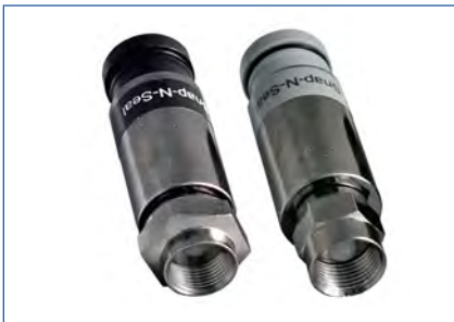
SNS1P11H and 716SNS1P11HPLA ProSNS™ Universal RG-11 Connectors