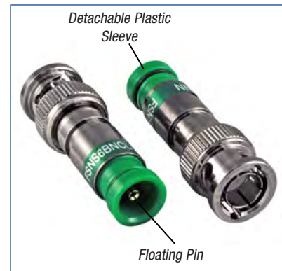
FSNS6BNCU ProSNS™ Universal BNC Series 6 Connector

Like our 59 and 6 connectors, the ProSNS™ RG-11 F connectors utilize a plastic pin guide for greater connector performance and easy installation.