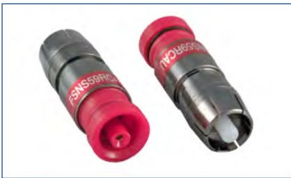
FSNS59RCAU ProSNS™ Universal RCA Connector