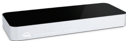
OWC Thunderbolt 2 dock