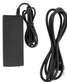
Power supply and cable

IMPORTANT: Driver required for Apple SuperDrive support, Apple Keyboard Support, and for charging iPad 1/2/3 . Please see Section 2.2 – Usage Notes for more details.