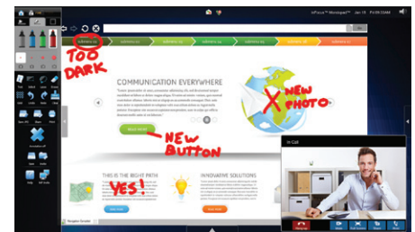
Whiteboard and Annotation