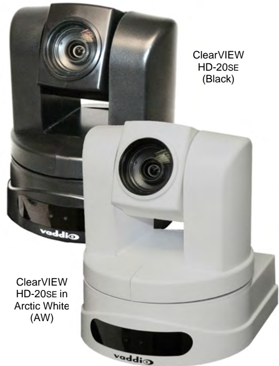
ClearVIEW HD-20SE (Black)

The ClearVIEW HD-20SE is an exceptional value and a remarkable camera for even the most demanding HD video applications including House of Worship productions, pro A/V system integration, distance learning classrooms, live events, IMAG systems, UCC applications, videoconferencing, distance learning and lecture capture. To top it all off, the ClearVIEW HD-20SE cameras are available in black or arctic white.