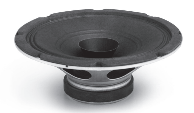
C10A Series Speaker

Pre-Assembled 8" Loudspeaker & Baffle for use with IP Speakers