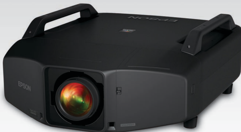
Projector shown with lens. Lens sold separately.