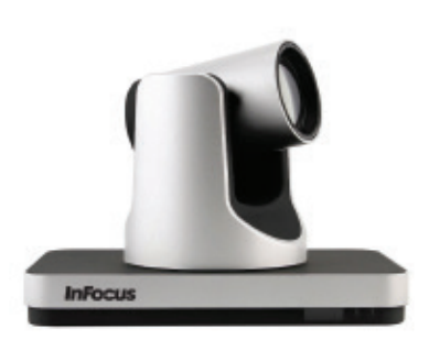
RealCam PTZ Camera