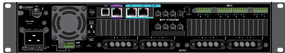
8|600N model shown