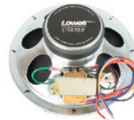
Mounted driver and transformer