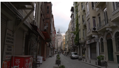
Wide angle (28.8 mm)

The high-performance Sony G Lens provided with the HXR-NX3/1 offers an expansive 28.8 mm (35mm full-frame format equivalent) angle of view at the wide end, with a 20x optical zoom range that will easily cover most shooting situations. When more reach is required, Clear Image Zoom employs Super Resolution Technology to provide excellent image quality at between 20x and 40x range.