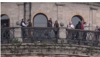
40x Clear Image Zoom (1152 mm)