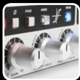
Pristine class leading ADC