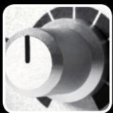
World class Audient mic pres