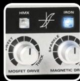
2 x RETRO Channels with tone shaping