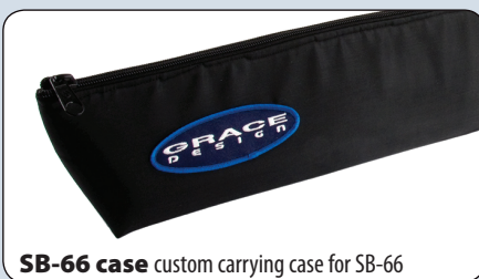
SB-66 case custom carrying case for SB-66