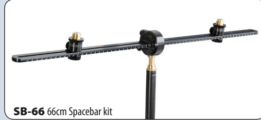
SB-66 66cm Spacebar kit