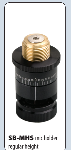
SB-MHS mic holder regular height