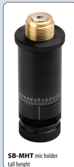
SB-MHT mic holder tall height