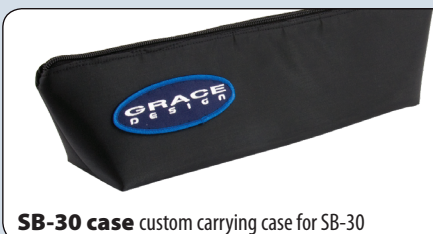
SB-30 case custom carrying case for SB-30