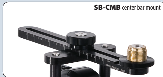
SB-CMB center bar mount