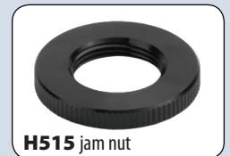
H515 jam nut