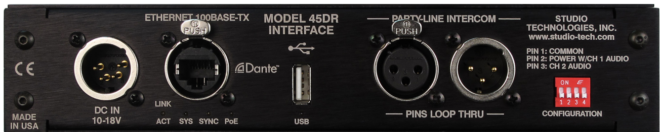
Figure 2. Model 45DR back view