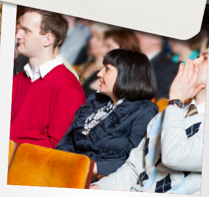
Small Lecture Halls