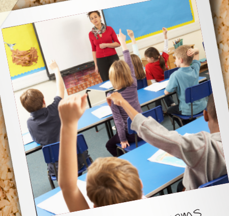
Use in classrooms