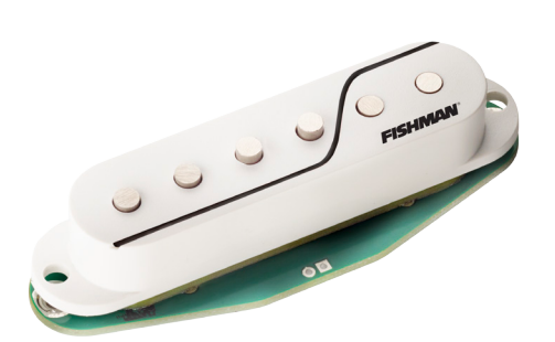
SINGLE WIDTH FOR STRAT®