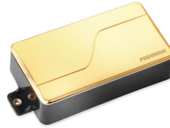
Modern Humbucker Alnico (Gold) PRF-MHB-AG1

Cutting Ceramic attack. Brutal active aggression and passive punch in the same guitar. Great in both positions, or commonly paired w/Alnico neck.