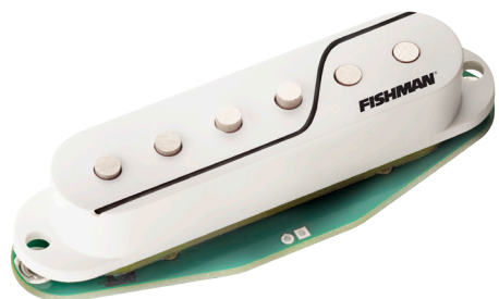
SINGLE WIDTH FOR STRAT®