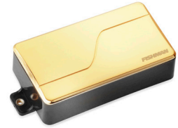
Modern Humbucker Ceramic (Gold) PRF-MHB-CG1