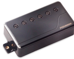
Classic Humbucker Neck (Black) PRF-CHB-NB1

The vintage neck humbucker tone we all love, combined with the up-front dynamics only Fluence can deliver.