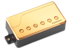
Classic Humbucker Bridge (Gold) PRF-CHB-BG1