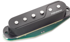
Single Width for Strat (Black) PRF-STR-BK1

* Standard 9V battery can also be used † Strat® is a registered trademark of FMI All specifications are subject to change without notice.