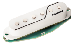
Single Width for Strat (White) PRF-STR-WH1

The most coveted, historical Strat® tones without the hum. From vintage sweetness and clarity to muscular overwound punch, in the same guitar.