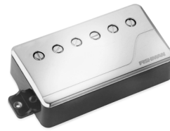
Classic Humbucker Neck (Nickel) PRF-CHB-NN1