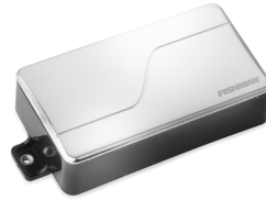
Modern Humbucker Alnico (Nickel) PRF-MHB-AN1