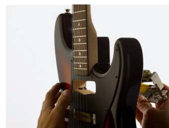
One of the many "shuttle" guitars used to make instantaneous pickup changes. Using the same guitar for all tests removed this significant variable.