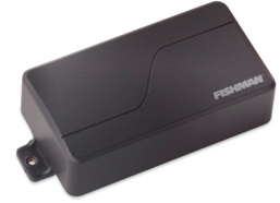
Modern Humbucker Ceramic (Black) PRF-MHB-CB1

Cutting Ceramic attack. Brutal active aggression and passive punch in the same guitar. Great in both positions, or commonly paired w/Alnico neck.