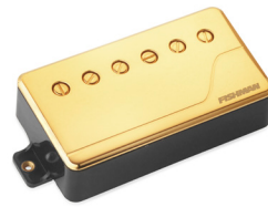
Classic Humbucker Neck (Gold) PRF-CHB-NG1

Two classic voices. Strong, "Calibrated P.A.F." and the Hot Rodded tone that redefined lead guitar, in the same pickup.