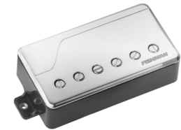
Classic Humbucker Bridge (Nickel) PRF-CHB-BN1