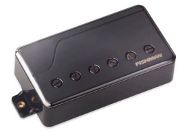
Classic Humbucker Bridge (Black) PRF-CHB-BB1

Two classic voices. Strong, "Calibrated P.A.F." and the Hot Rodded tone that redefined lead guitar, in the same pickup.