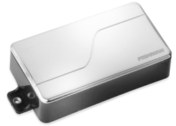
Modern Humbucker Ceramic (Nickel) PRF-MHB-CN1