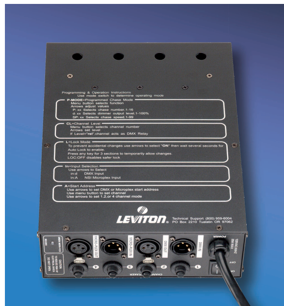
D4-DMX (side view)