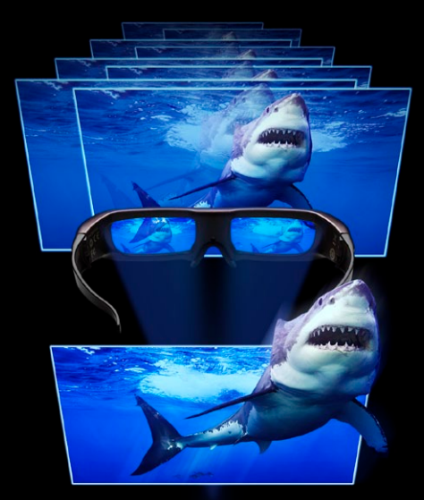
The PT-AE7000 and optional Panasonic active 3D Eyewear are finely tuned to achieve 3D viewing with Hollywood-like quality.

Hollywood continues to produce and release 3D movies that give us an entirely new level of dynamic realism. The PT-AE7000 Full HD 3D Home Cinema Projector was developed according to the Panasonic philosophy of providing images that mirror the director's artistic vision and intent—right in your own home. The PT-AE7000 has also been redesigned from the ground up to achieve higher basic 2D performance, and packed with unique 3D features to deliver the level of quality demanded by Hollywood professionals. The key 3D projection technologies were developed in collaboration with Panasonic Hollywood Laboratory (PHL) engineers, who have taken key roles in establishing the industry standards for 3D. This allows the PT-AE7000 to deliver both stunning 2D images and a comfortable and immersive 3D viewing experience at home.