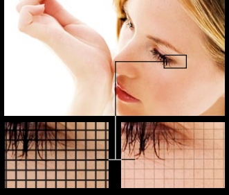
Conventional: Black lines betweet pixels mar picture

While many LCD projectors suffer from a "chicken wire" effect, Panasonic's pursuit of the highest possible image quality has successfully overcome this device limitation through the incorporation of Smooth Screen technology. This uses the double refraction property of crystals to arrange pixels on a screen with no gaps between them.