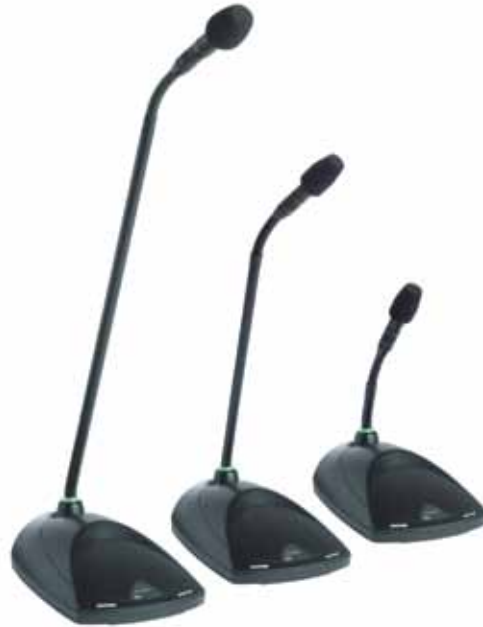
MX415, MX410 and MX405 with MX890 Wireless Desktop Base