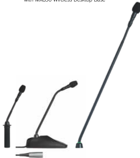
MX405 (with MX400SMP), MX410 (with MX400DP), MX415 without base

The MX890 Wireless Desktop Base is compatible with SLX4 and SLX4L Wireless Receivers.