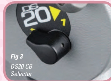
Fig 3 DS20 CB Selector

WARNING: Do not pan or tilt the Fluid Head whilst the PAN or the TILT LOCK is partially applied.