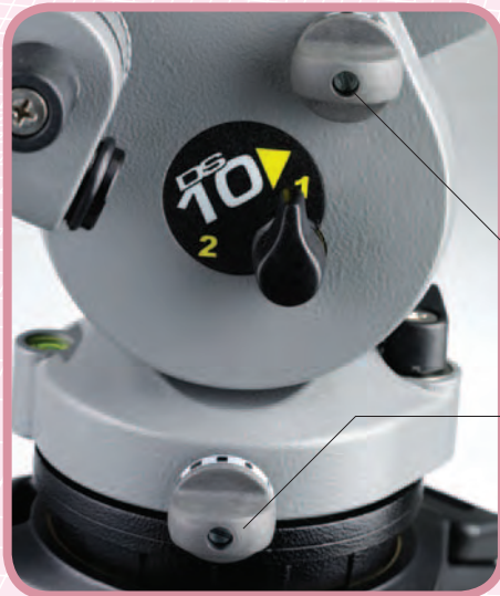
Fig 4 Drag control knobs

Note: The fluid drag plate system has been designed to suit most operating conditions. The friction drag adjustment should only be utilised when extra resistance is required.