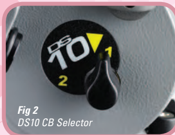
Fig 2 DS10 CB Selector

TIP Fine tuning can be achieved by adjusting the SLIDING PLATFORM - see step 2.5.