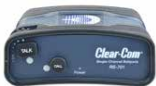
RS-701 Top View