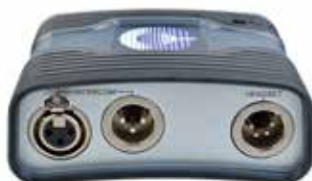
RS-701 Bottom View