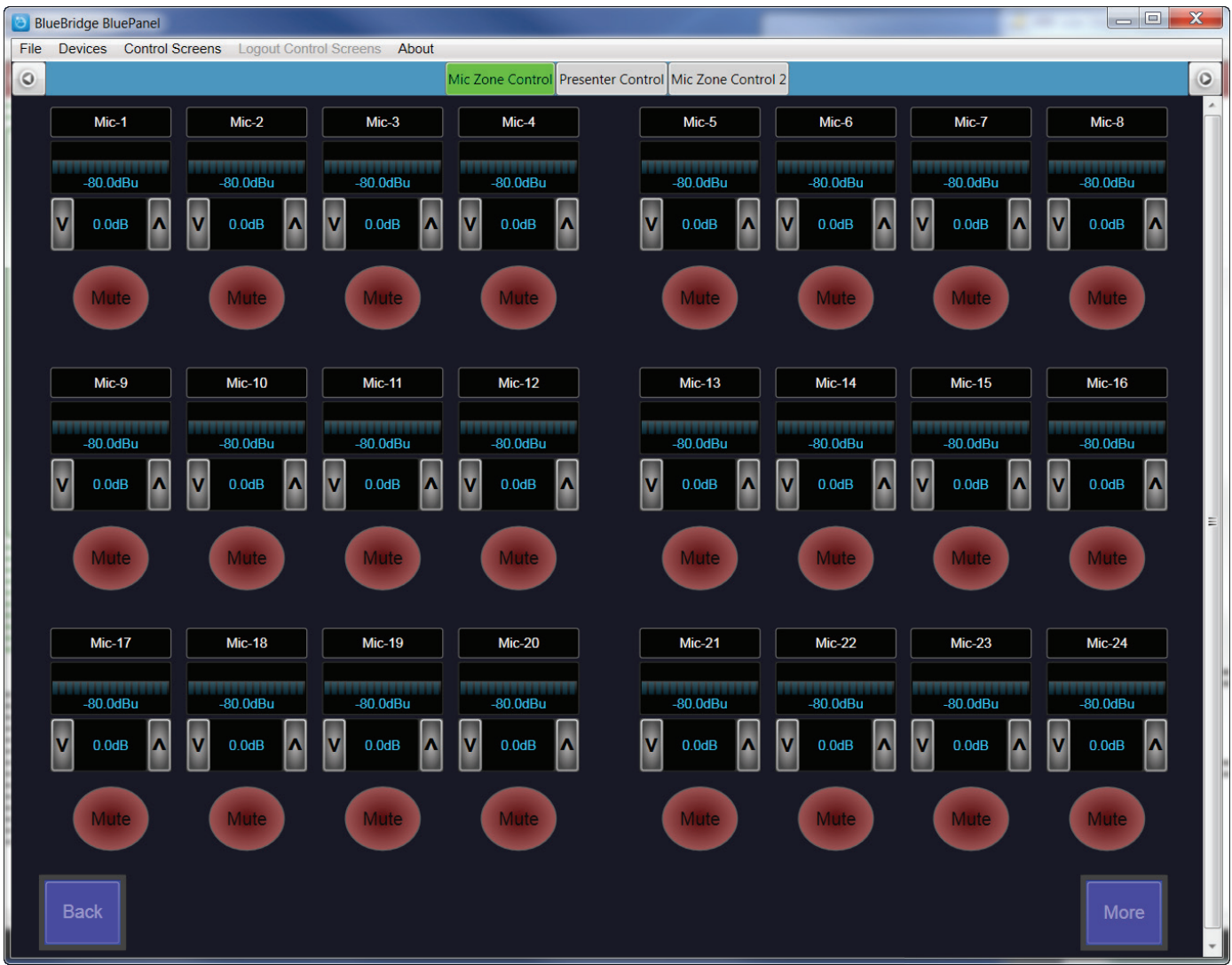
This BluePanel Control Offers Streamlined Operation & Visual Confirmation of 24 Microphone Inputs.

©2013 Atlas Sound L.P. All rights reserved. Atlas Sound and Strategy Series are trademarks of Atlas Sound L.P. All other trademarks are the property of their respective owners. AT5004616 RevA 4/13