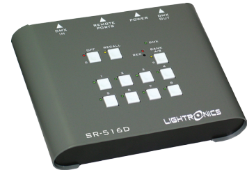
SR516D Desktop Architectural Controller

With our NEW inexpensive SR516 Unity Architectural Controller, adding Remote Wall Station Control to your existing DMX Dimming System has never been easier. The SR516 provides control of your house and stage lights from multiple locations. Additional SR516 features include: Show Mode Station Lockout via DMX, Emergency Bypass Relay, Retain previous Scenes from Power Off, Non-volatile Scene Memory, Mutually Exclusive Scene Grouping, Last Scene Recall, Record from Live DMX, 3 Configurable Contact Closures, 2 Gang Wall Box Installation.