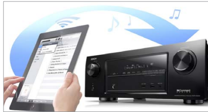
AirPlay lets you wirelessly stream music from your iPod touch, iPhone or iPad