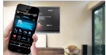
New Denon Remote App for iOS and Android devices