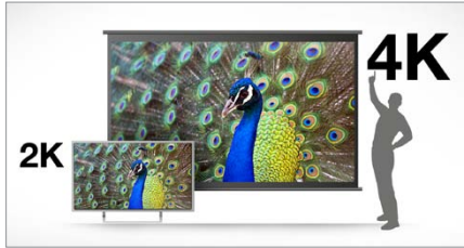
4K Ultra HD (3840x2160) support (Video pass-through, video upscaling)