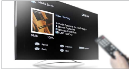
New intuitive GUI (Graphical User Interface)