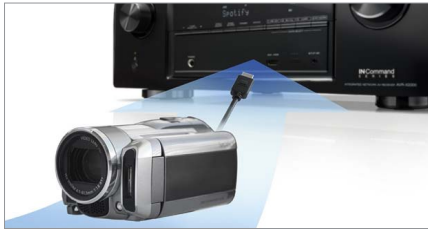
Convenient HDMI input on the front panel