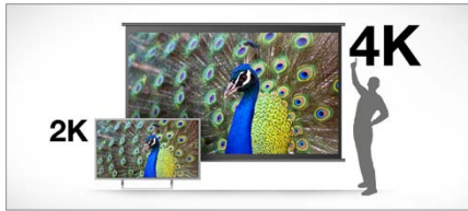
4K Ultra HD (3840x2160) support (Video pass-through, video upscaling)