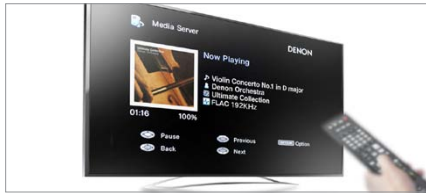
New intuitive GUI (Graphical User Interface)