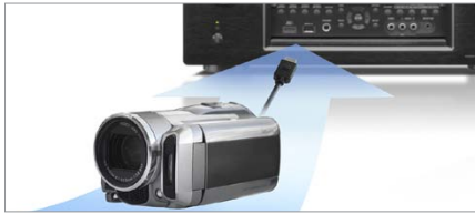
Convenient HDMI input on the front panel