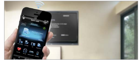
New Denon Remote App for iOS and Android devices