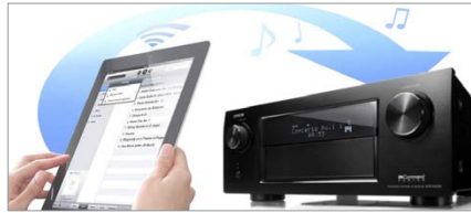
AirPlay lets you wirelessly stream music from your iPod touch, iPhone or iPad