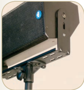
Tripod stand ready