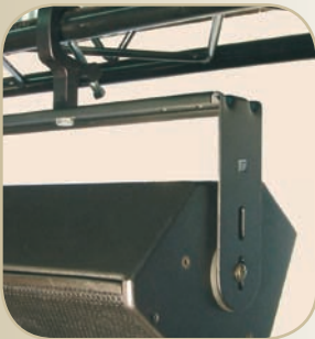
Truss and beam clamp ready