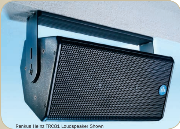
Renkus Heinz TRC81 Loudspeaker Shown